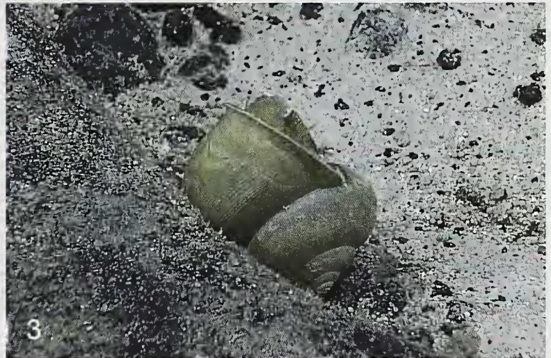
Figures 1–3. Gaza sp. 1, 2. Individual tumbling with foot extended. 3. Close-up detail.

description of a new Brazilian species. Zootaxa 1318: 1–40.